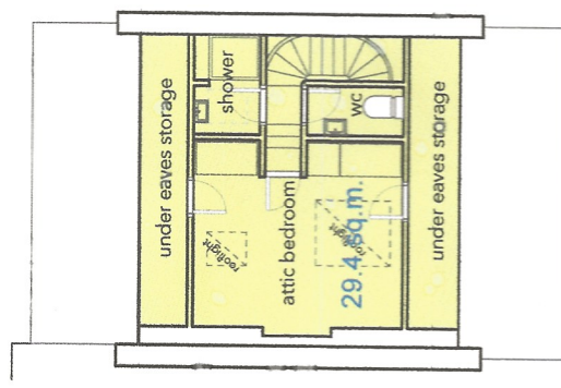
EXISTING ATTIC FLOOR PLAN