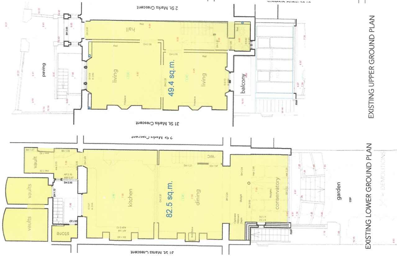
EXISTING LOWER GROUND PLAN